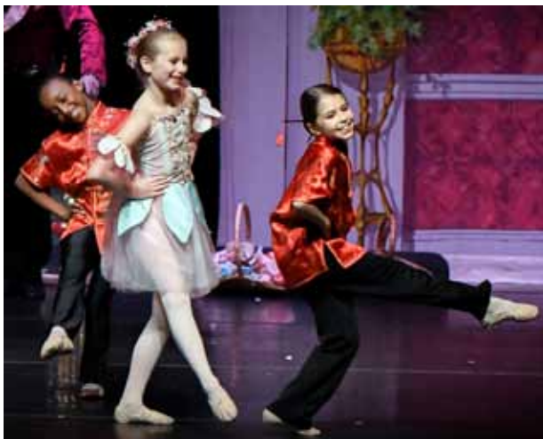
Ballet IV dancers in The Nutcracker