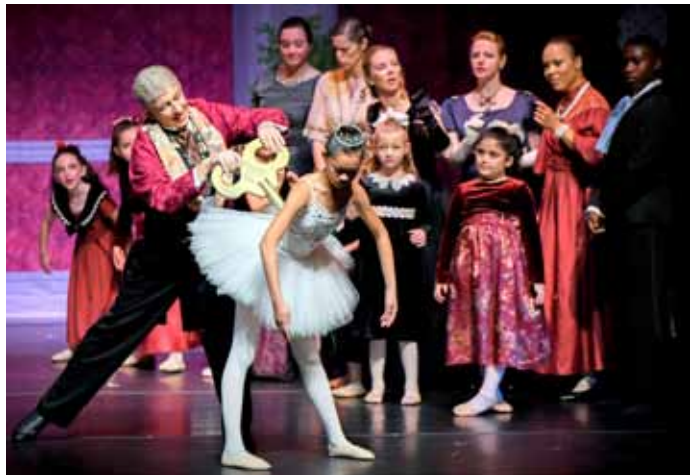
The Nutcracker party scene