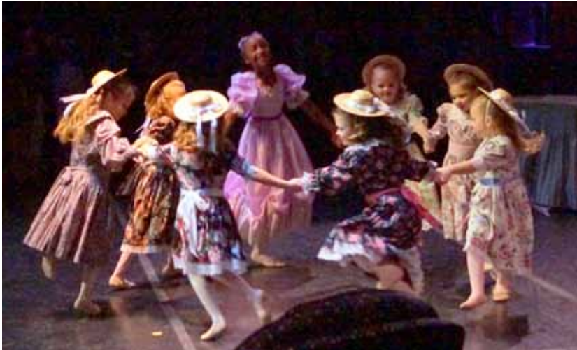
Pre-ballet dancers with Clara in The Nutcracker