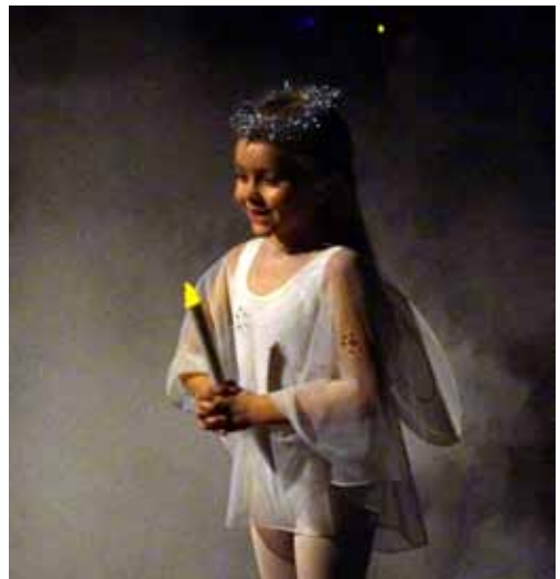
Ballet II dancer in The Nutcracker