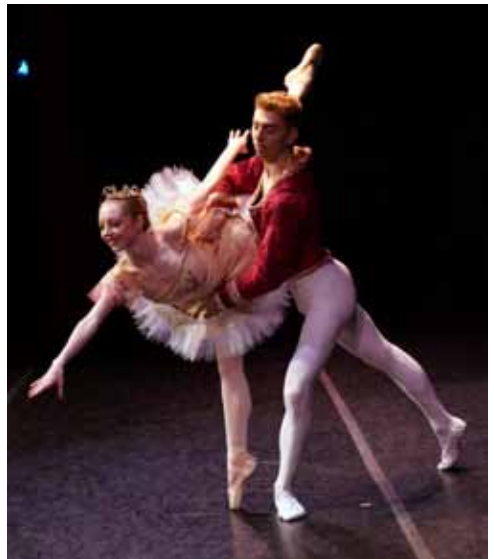
Advanced dancers in The Nutcracker